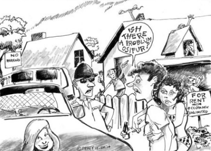
Image Courtesy of Dill Beaty/Destin Log http://www.thedestinlog.com/news/cartoon-short-term-vacation-rentals-1.415782?tc=cr